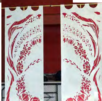
Banners created in the visual arts workshop