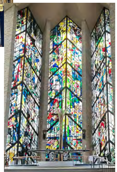
Chancel window in the Chapel