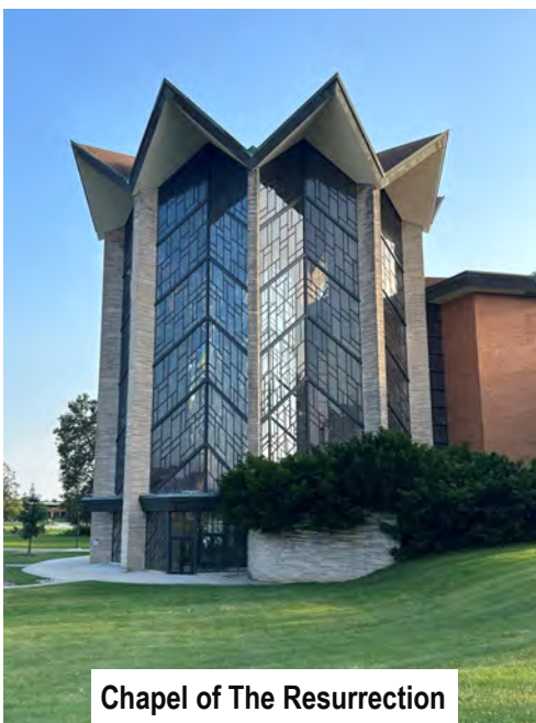
Chapel of The Resurrection

I was privileged to attend this conference to Ponder Anew how to communicate God's saving grace to all peoples in meaningful, relevant ways.