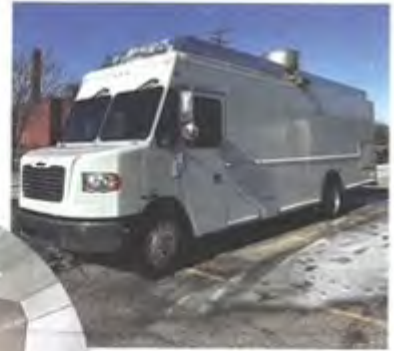
The new Metro45 Mobile Kitchen & Catering food truck